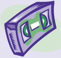
International Trade Module I